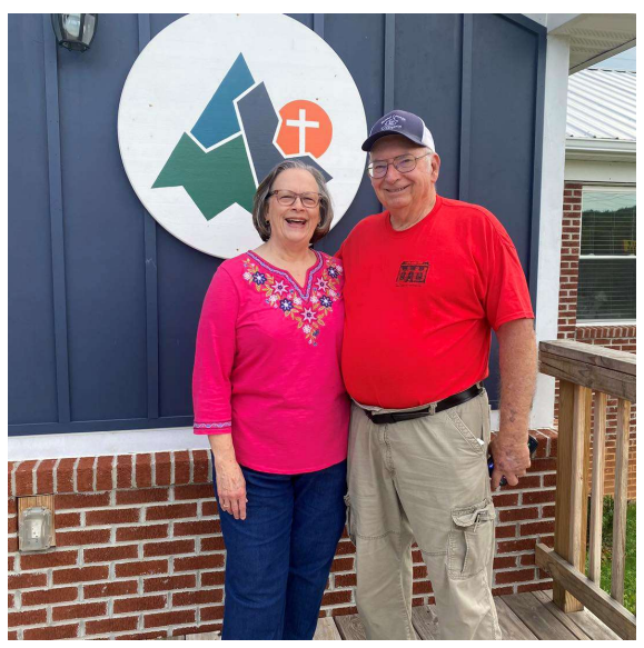
Looking for ways to help those affected by Hurricane Helene?

"All the believers were one in heart and mind. No one claimed that any of his possessions was his own, but they shared everything they had." Acts 4:32