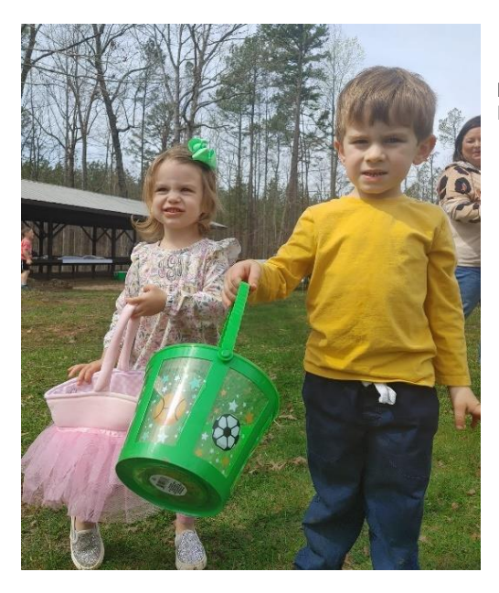
Mulberry Grove children enjoying the Easter Egg Hunt!

Below is a picture at the Mulberry Grove Sunrise Service