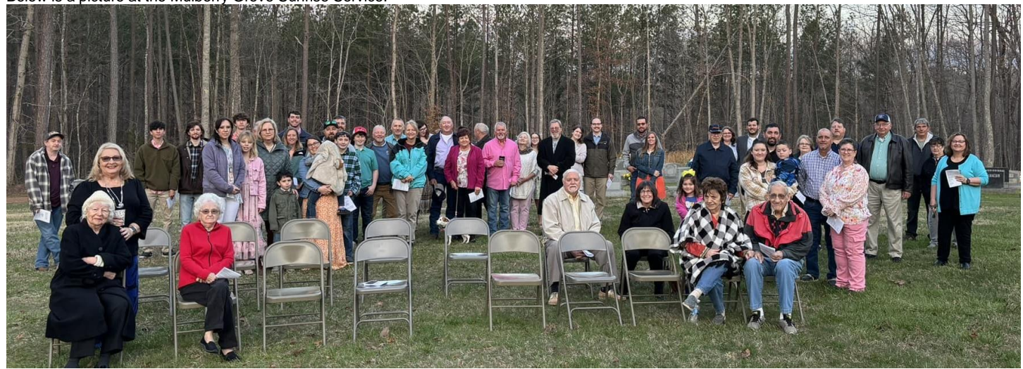
TAR WALLET: The Community Sunrise Service, hosted by Tar Wallet, was well attended. There was good worship, fellowship, and food!

Below is a picture at the Mulberry Grove Sunrise Service